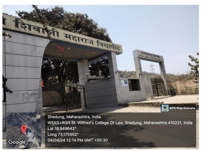
College Main Gate