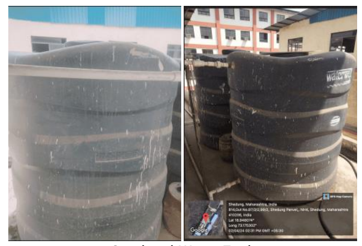
Overhead Water Tank