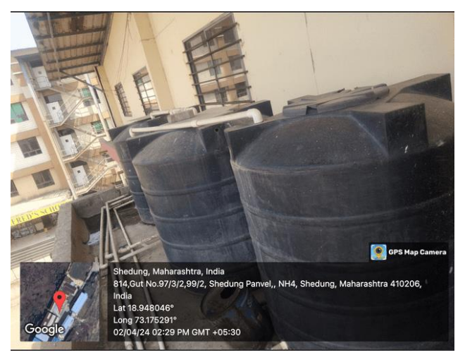
Overhead Water Tank