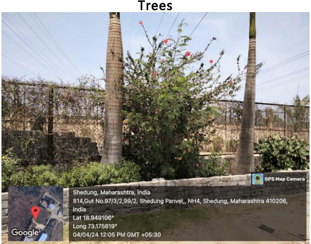
Trees and Plantation