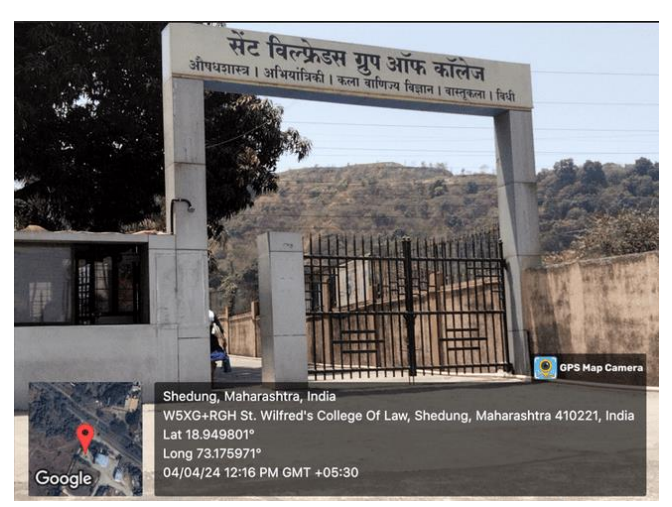
College Main Gate