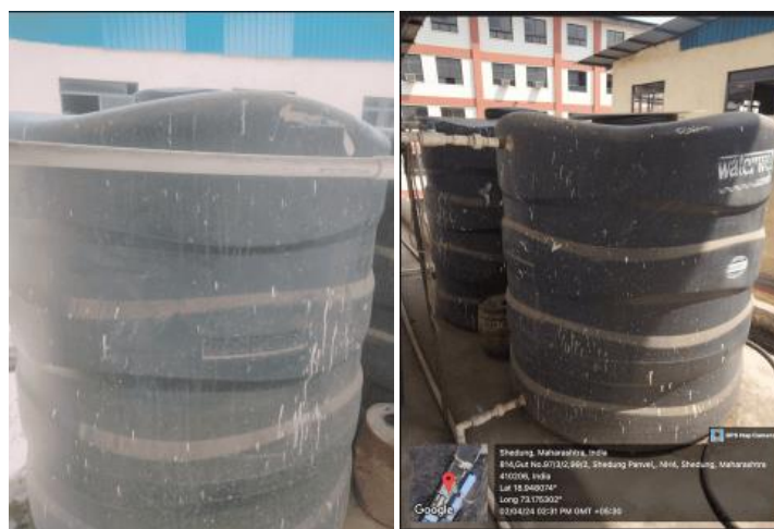
Overhead Water Tank