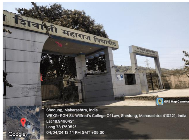
College Main Gate