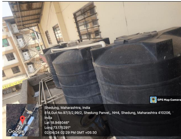
Overhead Water Tank