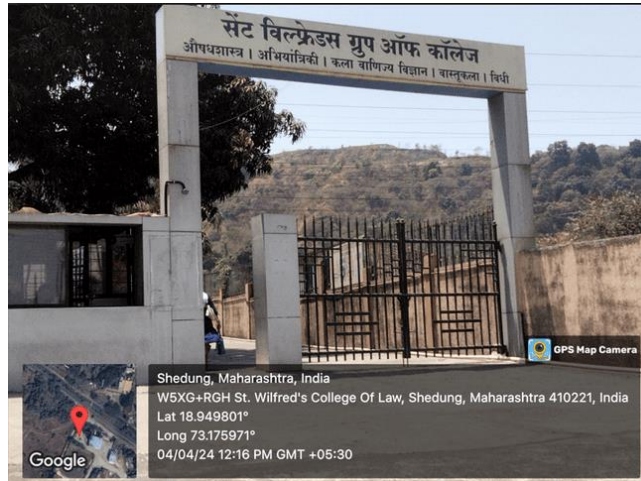
College Main Gate